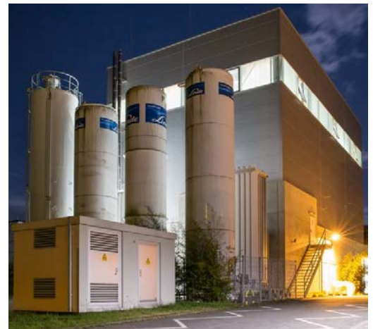
1 MW th pilot plant at TU Darmstadt

There will be the possibility to visit the 1 MW th pilot plant.